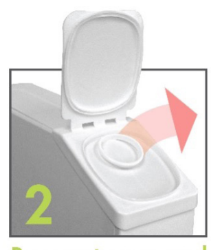
Remove tamper seal