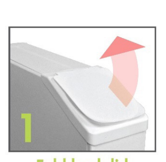
Fold back lid