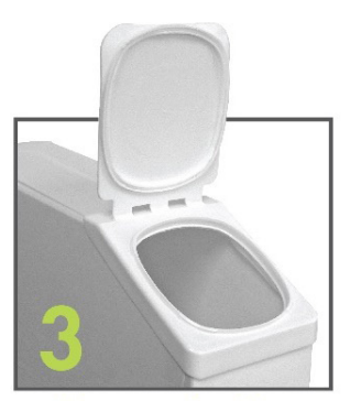
Pour and enjoy